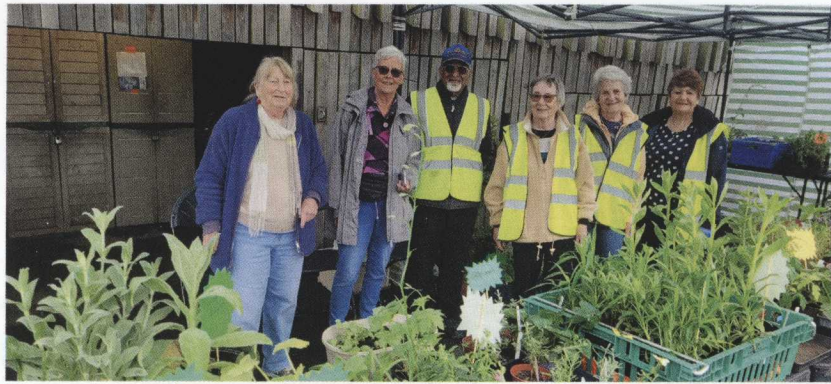
The team who manned the plant stall on Saturday.

A big thank you to everyone who supported the Friends group on 24th May.