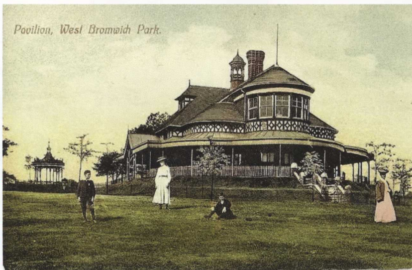
Pavilion, West Bromwich Park.

stand (Halfords Lane) to be built at the Hawthorns. His grave is in Heath Lane Cemetery.