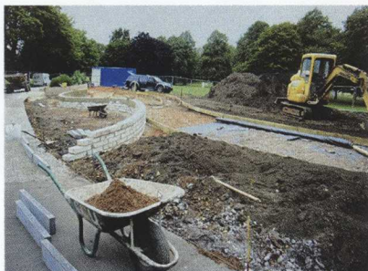
Photo of the sensory garden in 2012