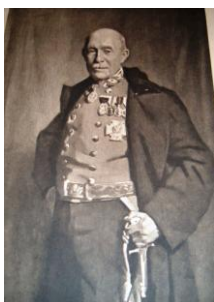
6 th Earl, William Heneage Legge